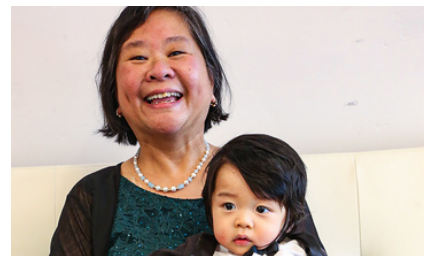
(Impact of the 2024 IMPACT Awards, continued on Page 4)